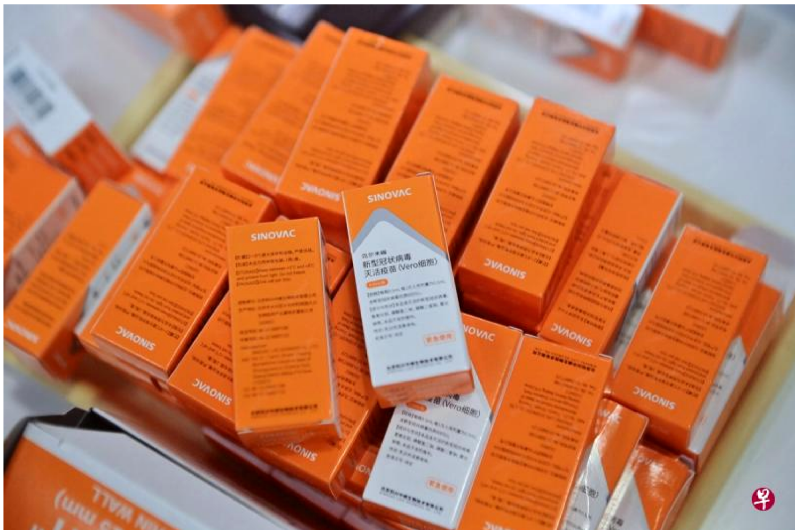
Local private medical institutions will be able to introduce and administer the China Coxing vaccine through special procedures. (AFP)