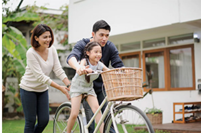
Making Space for Sustainability